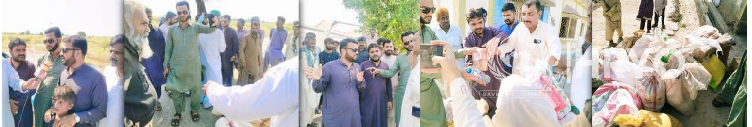
Sanghar: The Human Rights Youth Organization District Sanghar team distributed ration to the flood victims.